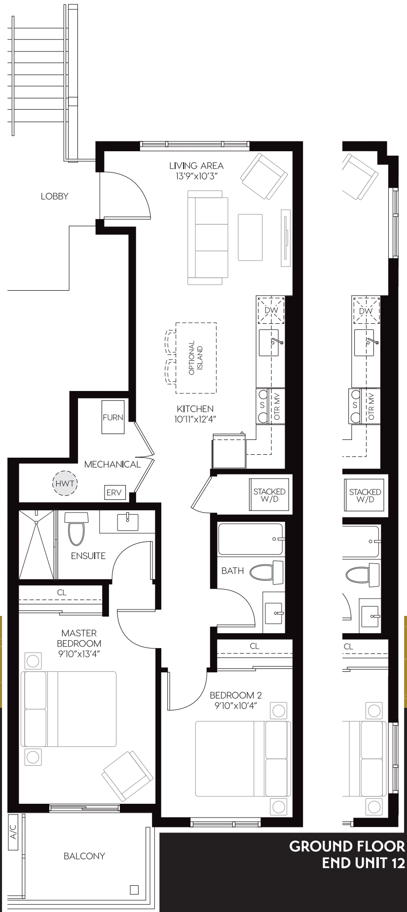
GROUND FLOOR END UNIT 12